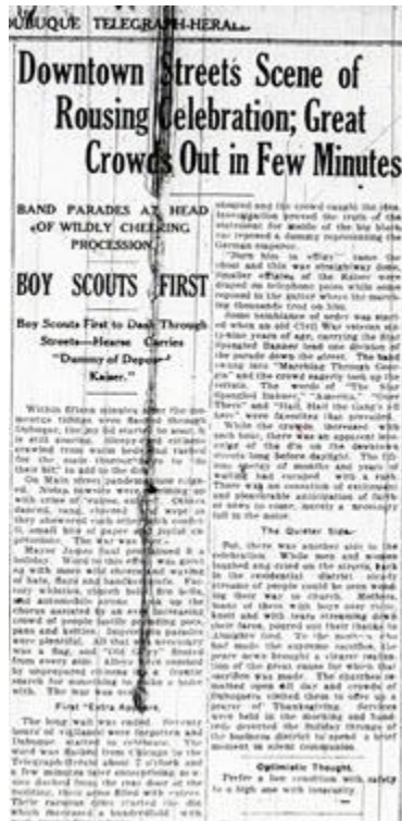
Figure. November 11, 1918 Telegraph Herald article indicates that the Boy Scouts are first to celebrate the end of The Great War

The news arrived in Dubuque around 2:00 a.m. on a cold morning in November, 1918. The war was over! When the much-anticipated news finally arrived, the Boy Scouts were the first to receive the news.