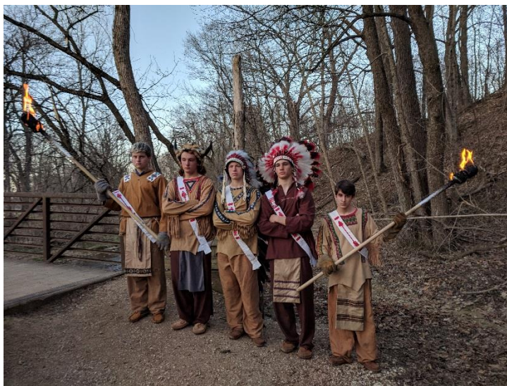
The Ceremony Team

All these events were made possible by the volunteers and Arrowmen who brought their cheerful spirits together in service to Timmeu and others!