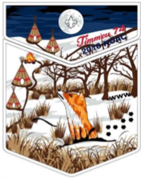
Collector Patch $10.00