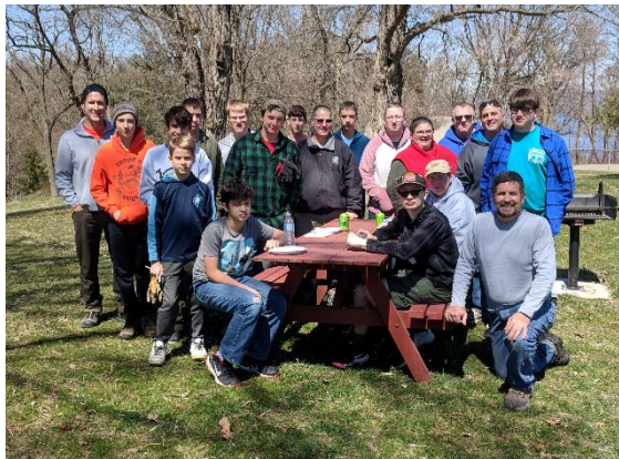
Volunteers at the Stick Pick-up

this fuss over picking sticks up?" This simple event, three hours long in total, helps Timmeu's biggest fundraiser – the Mother's Day Pancake Breakfast! By picking-up sticks in the park, the Lodge gets the $1 admission fee waived for anyone entering the park to attend the breakfast!