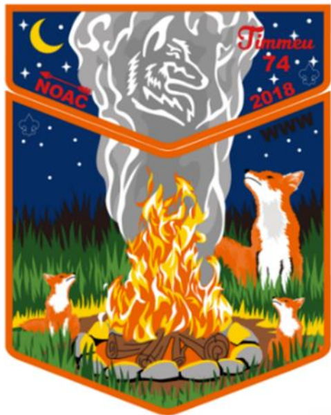
Trader Patch $10.00