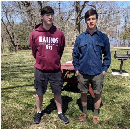
Volunteers at the Stick Pick-up

Saturday evening was the Dubuque Crossover ceremony. In the past, there were many individual crossover ceremonies for each Cub Scout Pack throughout Dubuque. This year, we tried having one large ceremony. With near perfect weather and about 30 Webelo's ready to become Boy Scouts, we couldn't have asked for a better trial for a new way to do Crossover ceremonies!