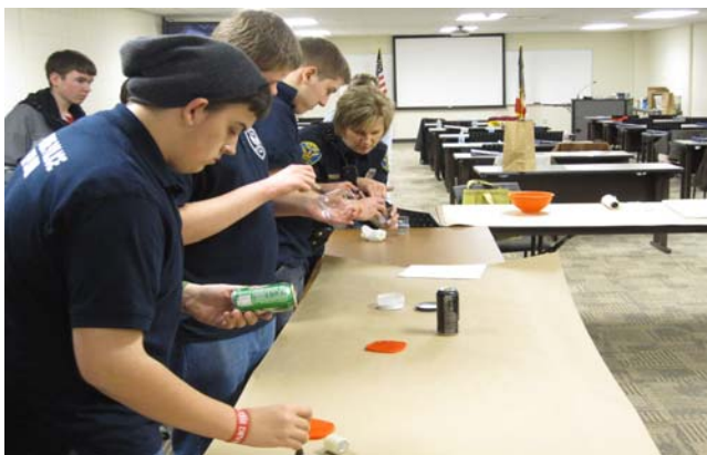
Explorers taking part in finger print extraction.

Learning for Life (LFL) offers an amazing array of exceptional education programs for the youth in our community who may or may not be involved in the scouting program. LFL can offer outdoor COPE program, leadership workshops, a character education curriculum, service project coordination, work-site visits, career fairs, and more. It is available to groups through schools, churches, or other youth organizations.